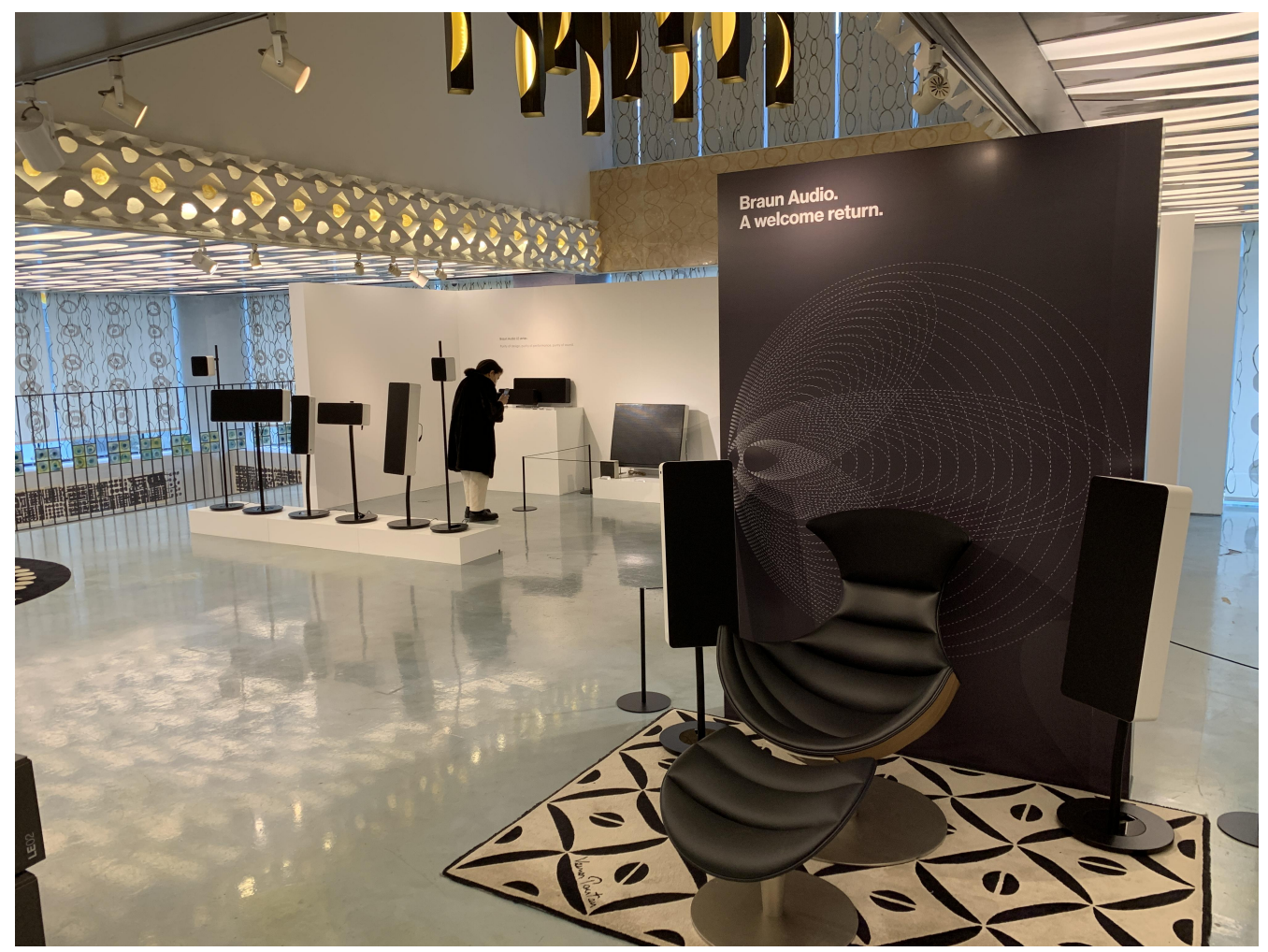
LE01 Stereo Set on display

KD Sound is our exclusive distributor in Korea and will take over marketing, customers service, and sales function for the brand.