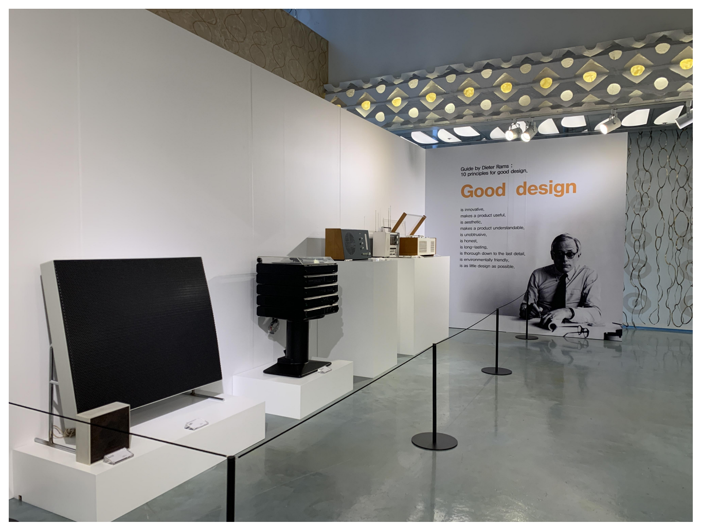
Pop-up Store 10 Corso Como Seoul